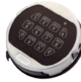
5750-K Round Entry