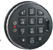
3125 Round Entry